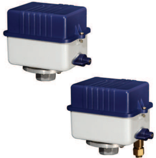
Fig. top: Pressure switch mechanical, model PSM-530 Fig. bottom: Pressure switch mechanical with relief valve, model PSM-530